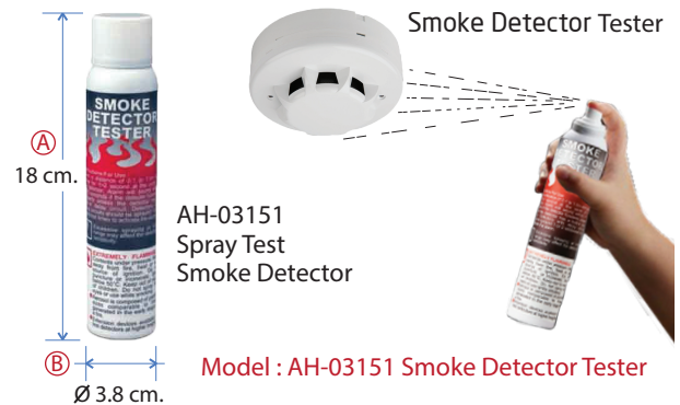
AH-03151 Spray Test Smoke Detector